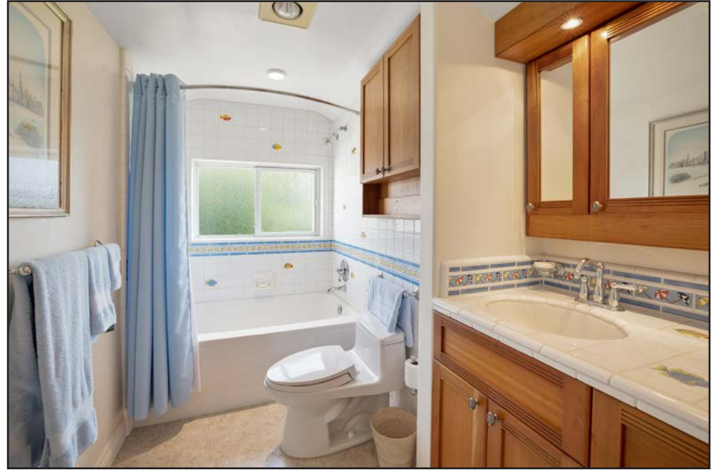
Beautiful Upstairs Bedroom Suite with Sitting Area & Full Bath